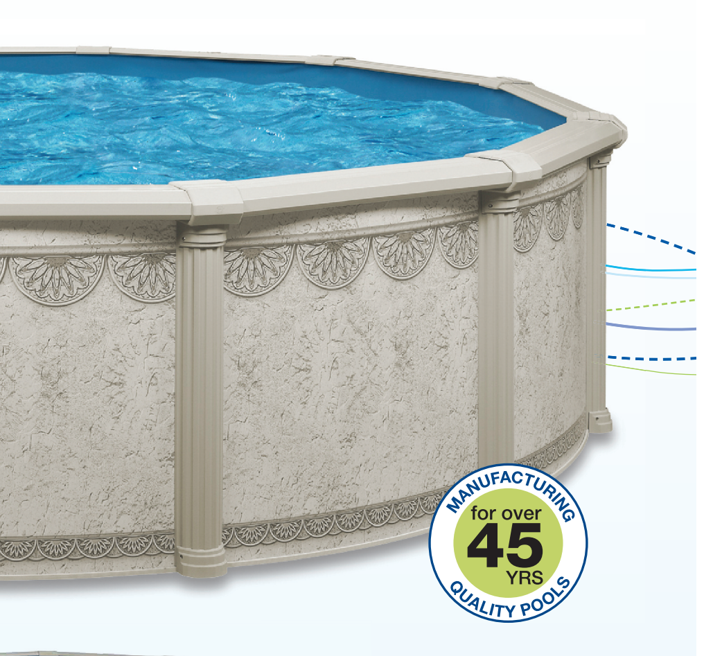
Form Fitting Support Cap